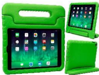
Shockproof Child Cover

For all students, parents should consider a strong case that provides protection to both the front and back of the iPad. Many cases come with a built-in stand, which aids better posture when using the iPad at a desk. Please view the recommended cases below. Make sure you check the model of your iPad before purchasing a case to ensure it fits the device.