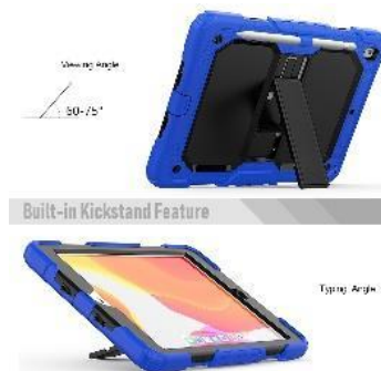
Child Safe Case